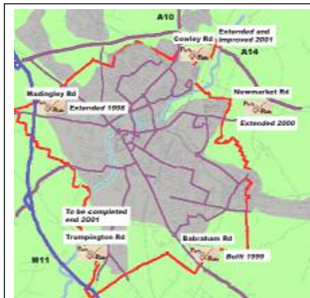
Park & Ride new build and enhancements since 1998

Park & Ride lies at the heart of the Council's transport policies. These aim to develop integrated and sustainable transport. Park and Ride is closely integrated with other initiatives aimed at reducing city centre congestion, as well as bus priority measures, cycleway improvements and pedestrian zones.